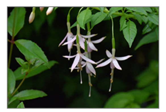
Maiden's Blush Hardy Fuchsia flowers