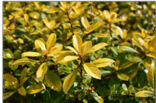
Gold Brian Escallonia foliage

Gold Brian Escallonia is recommended for the following landscape applications;