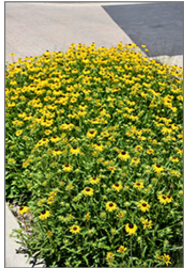
Viette's Little Suzy Coneflower in bloom