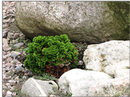
Stoneham Hinoki Falsecypress