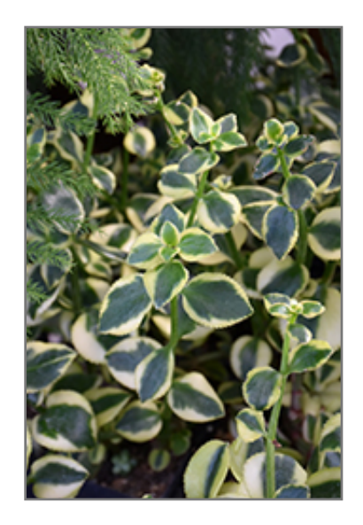
Variegated Trailing Jade foliage

When grown indoors, Variegated Trailing Jade can be expected to grow to be about 12 inches tall at maturity, with a spread of 3 feet. It grows at a slow rate, and under ideal conditions can be expected to live for approximately 15 years. This houseplant will do well in a location that gets either direct or indirect sunlight, although it will usually require a more brightly-lit environment than what artificial indoor lighting alone can provide. It prefers dry to average moisture levels with very well-drained soil, and may die if left in standing water for any length of time. This plant should be watered when the surface of the soil gets dry, and will need watering approximately once each week. Be aware that your particular watering schedule may vary depending on its location in the room, the pot size, plant size and other conditions; if in doubt, ask one of our experts in the store for advice. It is not particular as to soil type or pH; an average potting soil should work just fine. Be warned that parts of this plant are known to be toxic to humans and animals, so special care should be exercised if growing it around children and pets.