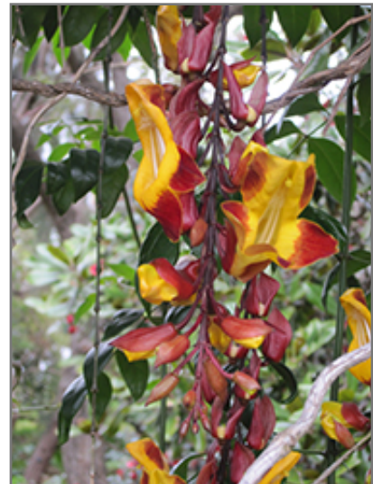
Brick & Butter Vine flowers