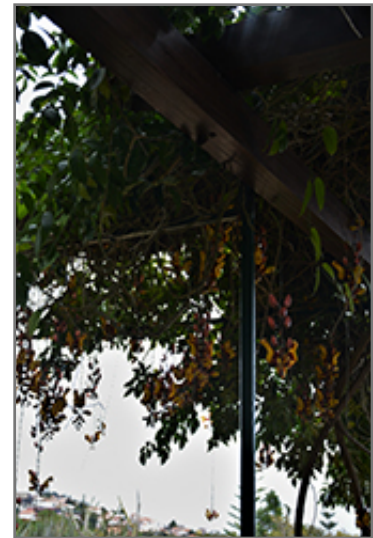
Brick & Butter Vine in bloom

Brick & Butter Vine makes a fine choice for the outdoor landscape, but it is also well-suited for use in outdoor pots and containers. Because of its spreading habit of growth, it is ideally suited for use as a 'spiller' in the 'spiller-thriller-filler' container combination; plant it near the edges where it can spill gracefully over the pot. It is even sizeable enough that it can be grown alone in a suitable container. Note that when grown in a container, it may not perform exactly as indicated on the tag - this is to be expected. Also note that when growing plants in outdoor containers and baskets, they may require more frequent waterings than they would in the yard or garden.