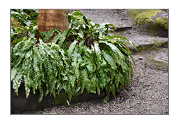
Hart's Tongue Fern