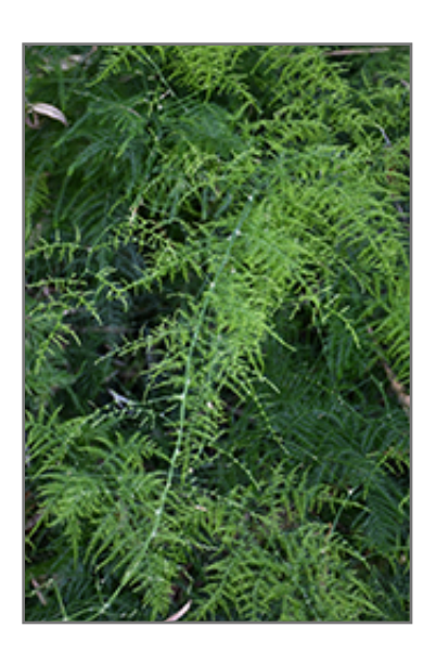
Asparagus Fern foliage

When grown indoors, Asparagus Fern can be expected to grow to be about 5 feet tall at maturity, with a spread of 24 inches. It grows at a fast rate, and under ideal conditions can be expected to live for approximately 10 years. This houseplant performs well in both bright or indirect sunlight and strong artificial light, and can therefore be situated in almost any well-lit room or location. It does best in average to evenly moist soil, but will not tolerate standing water. The surface of the soil shouldn't be allowed to dry out completely, and so you should expect to water this plant once and possibly even twice each week. Be aware that your particular watering schedule may vary depending on its location in the room, the pot size, plant size and other conditions; if in doubt, ask one of our experts in the store for advice. It is particular about its soil conditions, with a strong preference for rich, acidic soil. Contact the store for specific recommendations on pre-mixed potting soil for this plant.