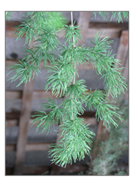
Myriocladus Asparagus Fern foliage

When grown indoors, Myriocladus Asparagus Fern can be expected to grow to be about 5 feet tall at maturity, with a spread of 3 feet. It grows at a medium rate, and under ideal conditions can be expected to live for approximately 20 years. This houseplant performs well in both bright or indirect sunlight and strong artificial light, and can therefore be situated in almost any well-lit room or location. It is very adaptable to both dry and moist soil, but will not tolerate any standing water. The surface of the soil shouldn't be allowed to dry out completely, and so you should expect to water this plant once and possibly even twice each week. Be aware that your particular watering schedule may vary depending on its location in the room, the pot size, plant size and other conditions; if in doubt, ask one of our experts in the store for advice. It is not particular as to soil pH, but grows best in rich soil. Contact the store for specific recommendations on pre-mixed potting soil for this plant.