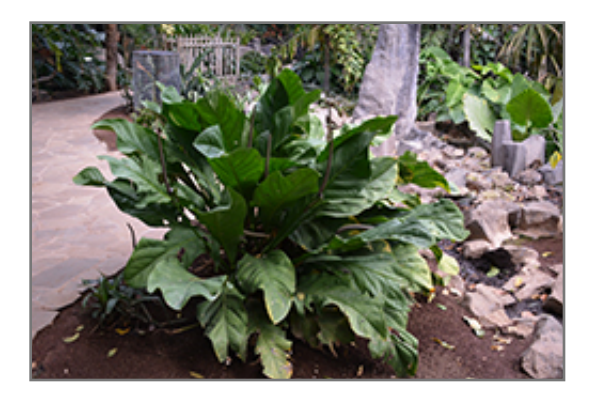
Pheasant's Tail

This is an open herbaceous evergreen houseplant with an upright spreading habit of growth. Its relatively coarse texture stands it apart from other indoor plants with finer foliage. This plant may benefit from an occasional pruning to look its best.