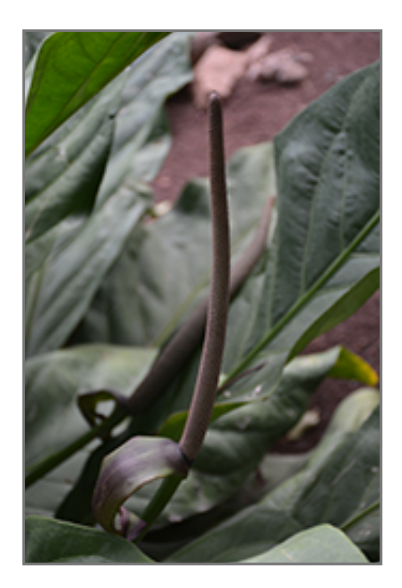
Pheasant's Tail flowers

8546 Sun Valley Road Anytown, USA 12345 204.782.4147