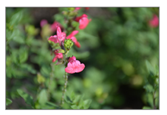
Berkeley Barb Sage flowers

Berkeley Barb Sage has masses of beautiful fragrant hot pink flowers with red overtones at the ends of the stems from early spring to early winter, which are most effective when planted in groupings. The flowers are excellent for cutting. Its small pointy leaves remain green in color throughout the year.