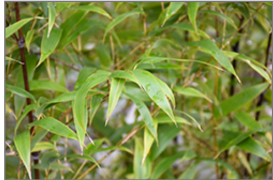
Hale Black Bamboo foliage