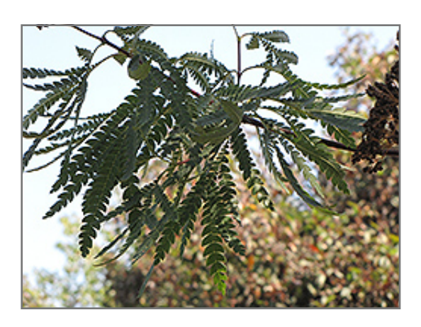
Santa Cruz Island Ironwood foliage