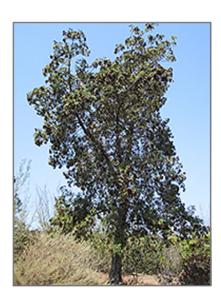
Santa Cruz Island Ironwood

Santa Cruz Island Ironwood is recommended for the following landscape applications: