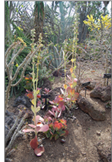
Paddle Plant in bloom