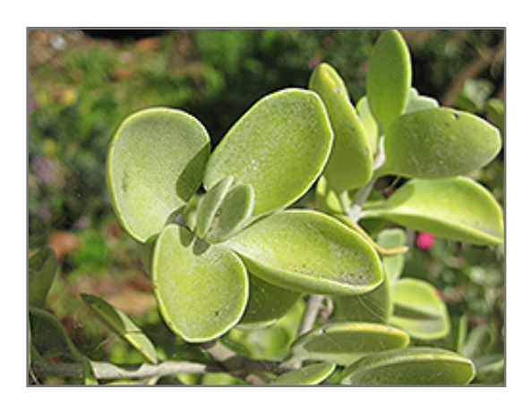
Silver Teaspoons foliage

Silver Teaspoons is recommended for the following landscape applications;