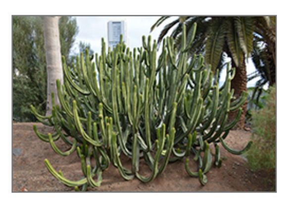
Canary Island Spurge

A visually striking succulent shrub featuring spiny, green vertical stems that arise from a base and form a solid clump; small reddish green flowers in mid to late spring; great for rock gardens, borders or containers; white sap is poisonous