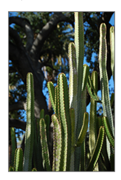
Canary Island Spurge flowers

This is a relatively low maintenance shrub, and usually looks its best without pruning, although it will tolerate pruning. Deer don't particularly care for this plant and will usually leave it alone in favor of tastier treats. Gardeners should be aware of the following characteristic(s) that may warrant special consideration;