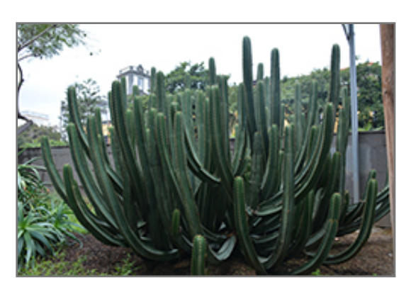
Canary Island Spurge

This shrub does best in full sun to partial shade. It prefers dry to average moisture levels with very well-drained soil, and will often die in standing water. It is considered to be drought-tolerant, and thus makes an ideal choice for xeriscaping or the moisture-conserving landscape. It is not particular as to soil pH, but grows best in sandy soils, and is able to handle environmental salt. It is somewhat tolerant of urban pollution. This species is not originally from North America, and parts of it are known to be toxic to humans and animals, so care should be exercised in planting it around children and pets.