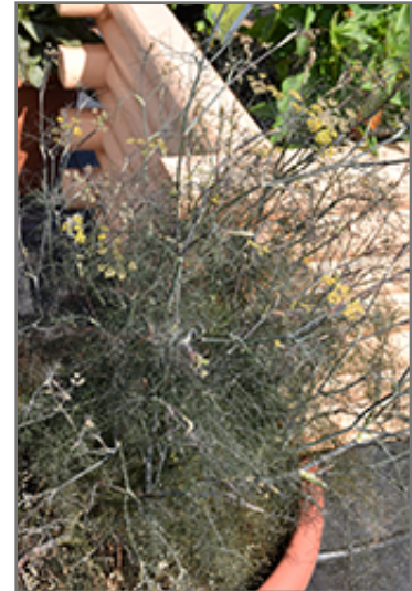
Licorice Towers Fennel