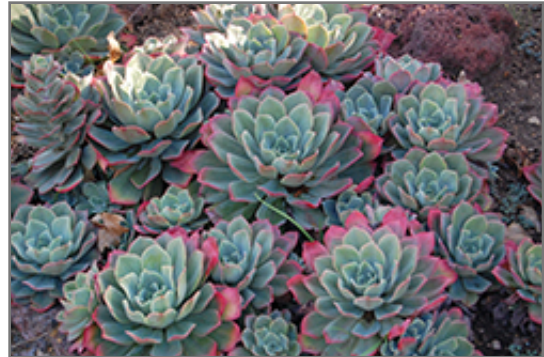
Blue Mist Echeveria