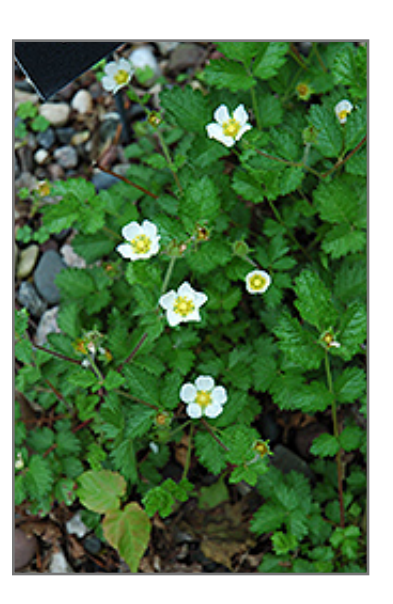
Rock Cinquefoil flowers

Rock Cinquefoil will grow to be about 8 inches tall at maturity, with a spread of 8 inches. When grown in masses or used as a bedding plant, individual plants should be spaced approximately 6 inches apart. Its foliage tends to remain low and dense right to the ground. It grows at a medium rate, and under ideal conditions can be expected to live for approximately 10 years. As an herbaceous perennial, this plant will usually die back to the crown each winter, and will regrow from the base each spring. Be careful not to disturb the crown in late winter when it may not be readily seen!