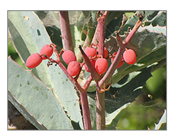
Wild Grape fruit