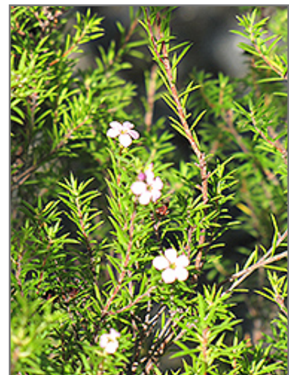
Compact Diosma flowers