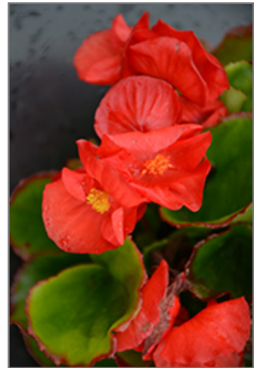
Sprint Plus Red Begonia flowers