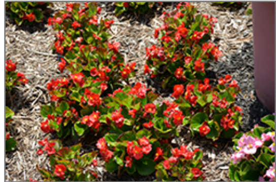
Sprint Plus Red Begonia in bloom