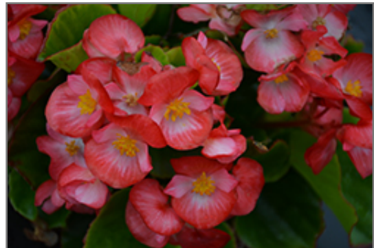
Sprint Plus Blush Begonia flowers

Sprint Plus Blush Begonia is recommended for the following landscape applications;