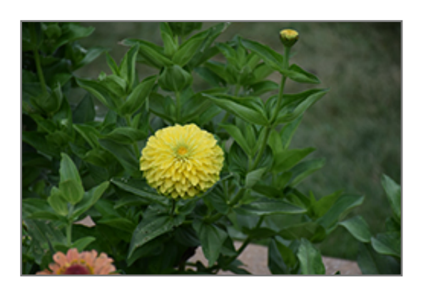
Queeny Lime Zinnia flowers