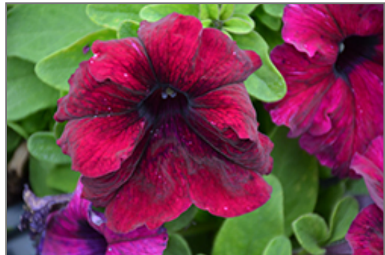
Success! HD Burgundy Petunia flowers

Success! HD Burgundy Petunia is recommended for the following landscape applications;