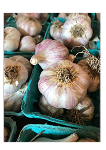
Siberian Garlic fruit

Siberian Garlic will grow to be about 24 inches tall at maturity, with a spread of 12 inches. When planted in rows, individual plants should be spaced approximately 6 inches apart. It grows at a fast rate, and under ideal conditions can be expected to live for approximately 5 years. As an herbaceous perennial, this plant will usually die back to the crown each winter, and will regrow from the base each spring. Be careful not to disturb the crown in late winter when it may not be readily seen!