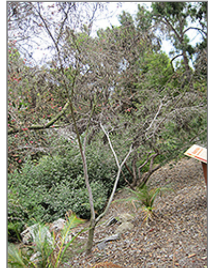
Jedda's Dream Agonis