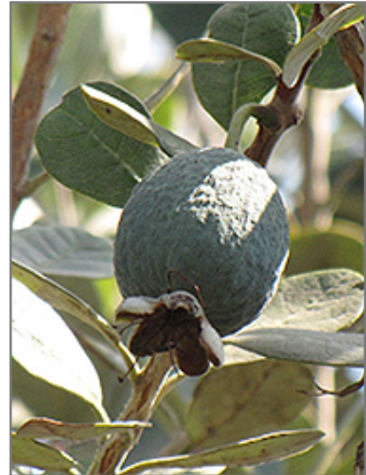
Mammoth Pineapple Guava fruit