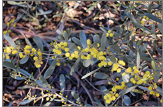
Low Boy Prostrate Acacia flowers

This shrub does best in full sun to partial shade. It is very adaptable to both dry and moist growing conditions, but will not tolerate any standing water. It is considered to be drought-tolerant, and thus makes an ideal choice for a low-water garden or xeriscape application. It is not particular as to soil pH, but grows best in sandy soils, and is able to handle environmental salt. It is somewhat tolerant of urban pollution. This is a selected variety of a species not originally from North America.