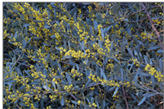
Low Boy Prostrate Acacia foliage