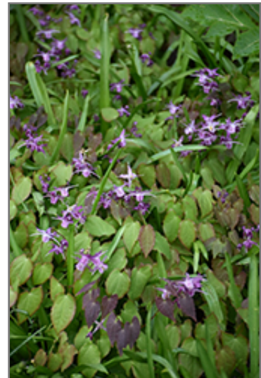
Dark Beauty Bishop's Hat flowers