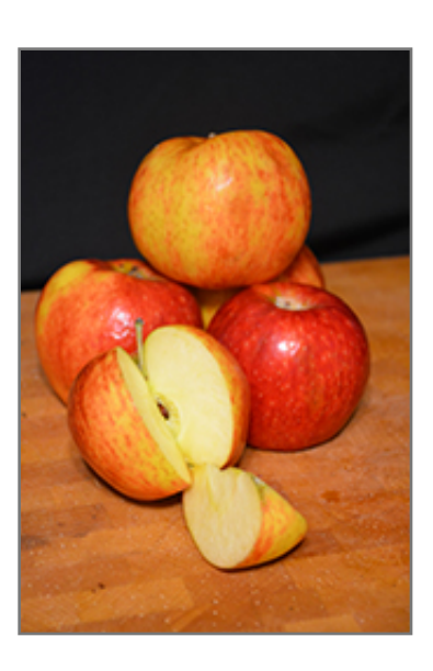
Pazzaz Apple fruit and flesh

This is a deciduous tree with a more or less rounded form. Its average texture blends into the landscape, but can be balanced by one or two finer or coarser trees or shrubs for an effective composition. This is a high maintenance plant that will require regular care and upkeep, and is best pruned in late winter once the threat of extreme cold has passed. Gardeners should be aware of the following characteristic(s) that may warrant special consideration;