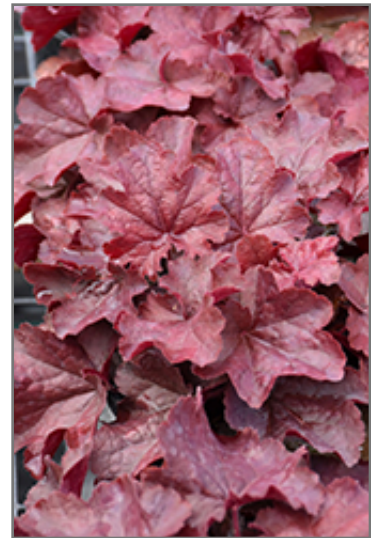
Northern Exposure Red Coral Bells foliage

Northern Exposure Red Coral Bells is recommended for the following landscape applications;