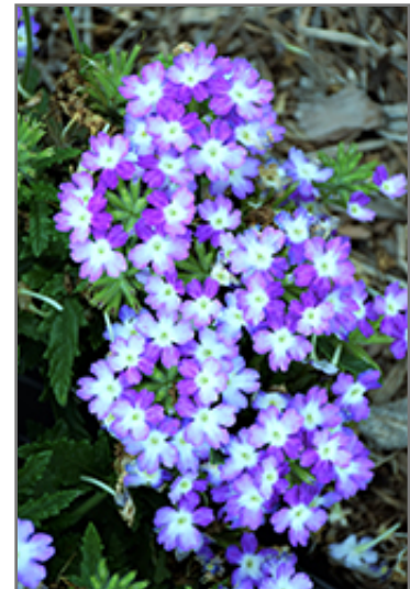
Hurricane Blue Verbena flowers

Hurricane Blue Verbena is recommended for the following landscape applications;