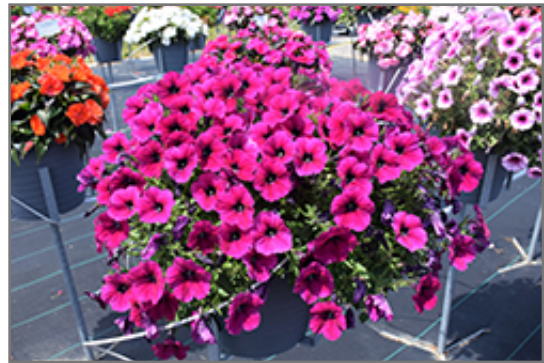
Sanguna Patio Purple Petunia in bloom

Sanguna Patio Purple Petunia is a fine choice for the garden, but it is also a good selection for planting in outdoor containers and hanging baskets. It is often used as a 'filler' in the 'spiller-thriller-filler' container combination, providing a mass of flowers against which the larger thriller plants stand out. Note that when growing plants in outdoor containers and baskets, they may require more frequent waterings than they would in the yard or garden.