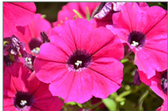
Sanguna Patio Purple Petunia flowers