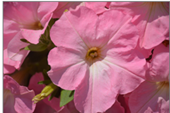
Sanguna Sweet Pink Petunia flowers

Sanguna Sweet Pink Petunia is recommended for the following landscape applications;