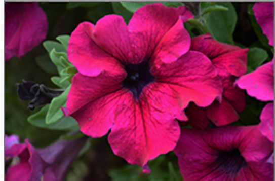
Sanguna Mega Purple Petunia flowers

This plant will require occasional maintenance and upkeep. Trim off the flower heads after they fade and die to encourage more blooms late into the season. It is a good choice for attracting butterflies and hummingbirds to your yard, but is not particularly attractive to deer who tend to leave it alone in favor of tastier treats. It has no significant negative characteristics.