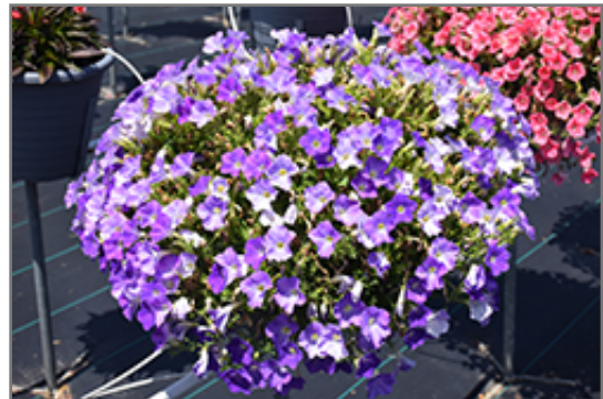
Dekko Sky Blue Petunia in bloom

Dekko Sky Blue Petunia is a fine choice for the garden, but it is also a good selection for planting in outdoor containers and hanging baskets. Because of its spreading habit of growth, it is ideally suited for use as a 'spiller' in the 'spiller-thriller-filler' container combination; plant it near the edges where it can spill gracefully over the pot. Note that when growing plants in outdoor containers and baskets, they may require more frequent waterings than they would in the yard or garden.