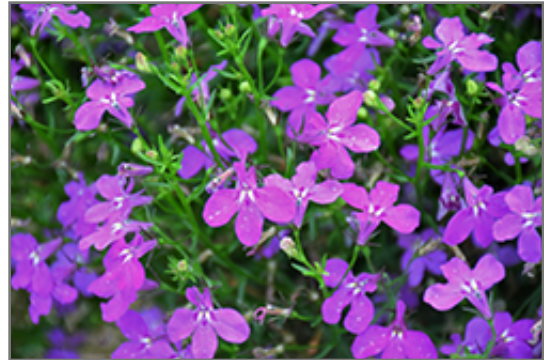
Hot Purple Lobelia flowers