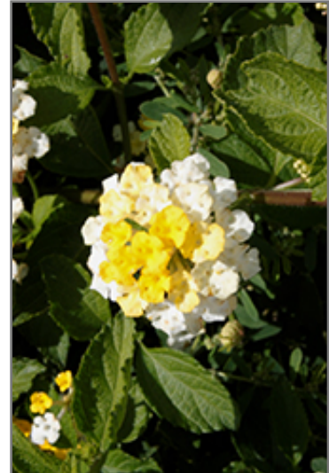
Landscape Bandana Lemon Zest Lantana flowers

Landscape Bandana Lemon Zest Lantana is recommended for the following landscape applications;