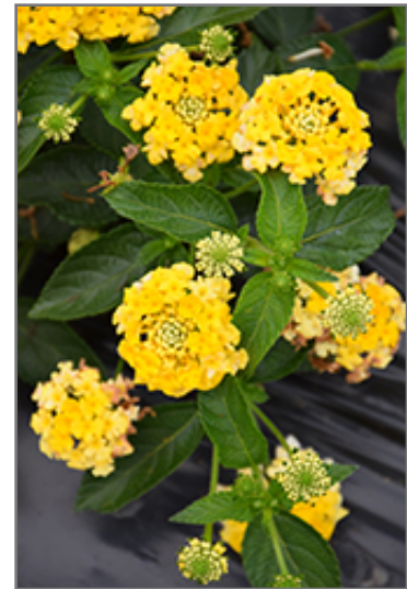
Landscape Bandana Lemon Zest Lantana flowers

Landscape Bandana Lemon Zest Lantana makes a fine choice for the outdoor landscape, but it is also well-suited for use in outdoor containers and hanging baskets. Because of its spreading habit of growth, it is ideally suited for use as a 'spiller' in the 'spiller-thriller-filler' container combination; plant it near the edges where it can spill gracefully over the pot. Note that when grown in a container, it may not perform exactly as indicated on the tag - this is to be expected. Also note that when growing plants in outdoor containers and baskets, they may require more frequent waterings than they would in the yard or garden.