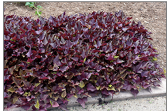
SolarPower Red Heart Sweet Potato Vine