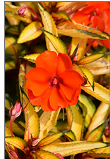
SunPatiens Vigorous Tropical Orange New Guinea Impatiens flowers

This plant will require occasional maintenance and upkeep, and should not require much pruning, except when necessary, such as to remove dieback. It has no significant negative characteristics.