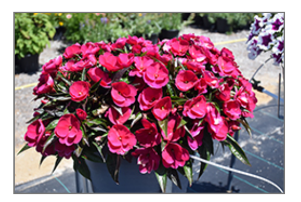
Sonic Deep Purple New Guinea Impatiens in bloom

Sonic Deep Purple New Guinea Impatiens will grow to be about 12 inches tall at maturity, with a spread of 12 inches. When grown in masses or used as a bedding plant, individual plants should be spaced approximately 10 inches apart. Its foliage tends to remain dense right to the ground, not requiring facer plants in front. This fast-growing annual will normally live for one full growing season, needing replacement the following year.