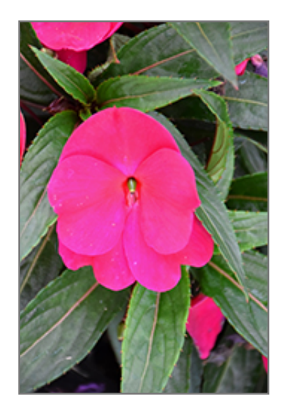
Sonic Deep Purple New Guinea Impatiens flowers

8546 Sun Valley Road Anytown, USA 12345 204.782.4147