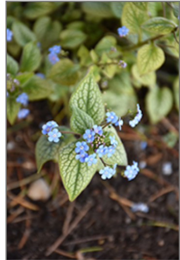
Alchemy Silver Bugloss flowers