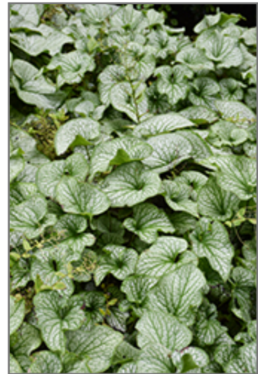
Alchemy Pewter Bugloss foliage