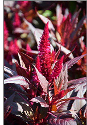
Kelos Fire Magenta Celosia flowers