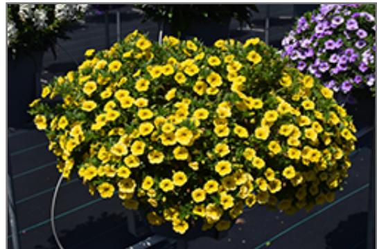
Lia Yellow Calibrachoa in bloom

Lia Yellow Calibrachoa is a fine choice for the garden, but it is also a good selection for planting in outdoor containers and hanging baskets. Because of its trailing habit of growth, it is ideally suited for use as a 'spiller' in the 'spiller-thriller-filler' container combination; plant it near the edges where it can spill gracefully over the pot. Note that when growing plants in outdoor containers and baskets, they may require more frequent waterings than they would in the yard or garden.