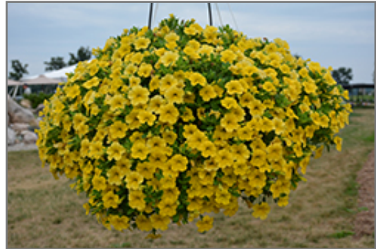
Lia Yellow Calibrachoa in bloom