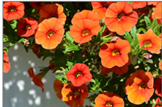
Colibri Orange Calibrachoa flowers

Colibri Orange Calibrachoa is recommended for the following landscape applications;