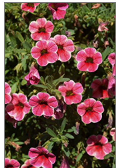
Colibri Cherry Lace Calibrachoa flowers