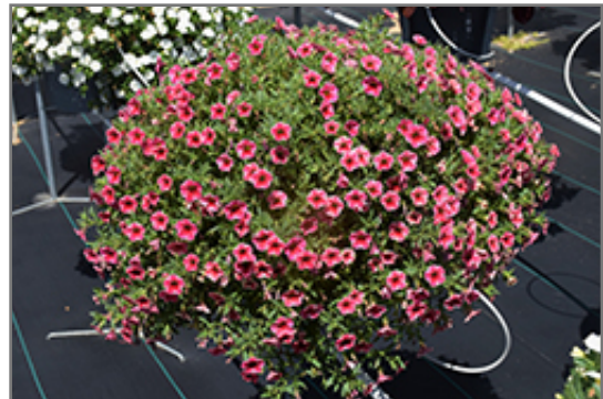
Colibri Cherry Lace Calibrachoa in bloom

Colibri Cherry Lace Calibrachoa is a fine choice for the garden, but it is also a good selection for planting in outdoor containers and hanging baskets. It is often used as a 'filler' in the 'spiller-thriller-filler' container combination, providing a mass of flowers against which the thriller plants stand out. Note that when growing plants in outdoor containers and baskets, they may require more frequent waterings than they would in the yard or garden.