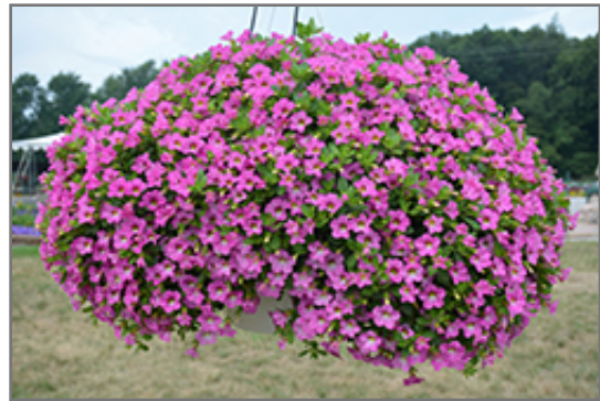
Chameleon Pink Diamond Calibrachoa in bloom

Chameleon Pink Diamond Calibrachoa is a fine choice for the garden, but it is also a good selection for planting in outdoor containers and hanging baskets. Because of its trailing habit of growth, it is ideally suited for use as a 'spiller' in the 'spiller-thriller-filler' container combination; plant it near the edges where it can spill gracefully over the pot. Note that when growing plants in outdoor containers and baskets, they may require more frequent waterings than they would in the yard or garden.