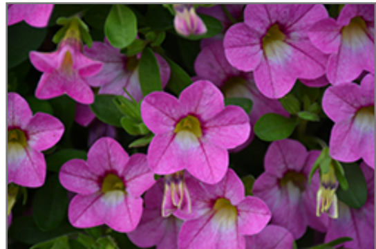
Chameleon Pink Diamond Calibrachoa flowers

Chameleon Pink Diamond Calibrachoa is a dense herbaceous annual with a trailing habit of growth, eventually spilling over the edges of hanging baskets and containers. Its medium texture blends into the garden, but can always be balanced by a couple of finer or coarser plants for an effective composition.