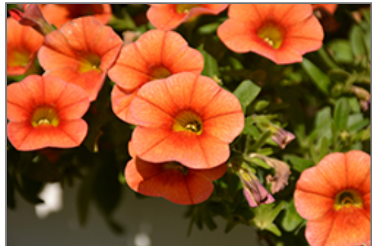
Calitastic Pumpkin Spice Calibrachoa flowers

Calitastic Pumpkin Spice Calibrachoa is recommended for the following landscape applications;